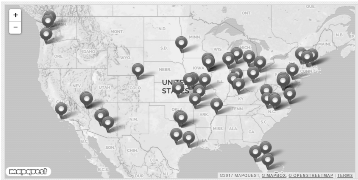
Figure 4. Star Communities: Participating Locations (Star Communities, 2017).

A total of 67 communities across the U.S. have become STAR-Certified since 2013. Figure 4 shows the map of the cities which have data available on the annual reporting platform.