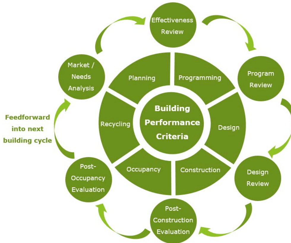
Figure 1 - Building performance evaluation: integrative framework for building delivery and life cycle (based on (Federal Facilities Council Staff, 2000).

Stevenson and Rijal (2010) have defined the POE framework as the evaluation of quantitative aspects that provide a physical performance baseline and qualitative aspects related to the evaluations of user responses or their behaviour. For the quantitative factors, it is important to define the indicators to be compared with the actual performance before starting the monitoring activity. These indicators can be obtained from many sources, such as requirements defined in building regulations, requirements from building certification methods, or Standards i.e. European Standards, ASHRAE Standards or ISO Standards (Guerra-Santin & Tweed, 2015).